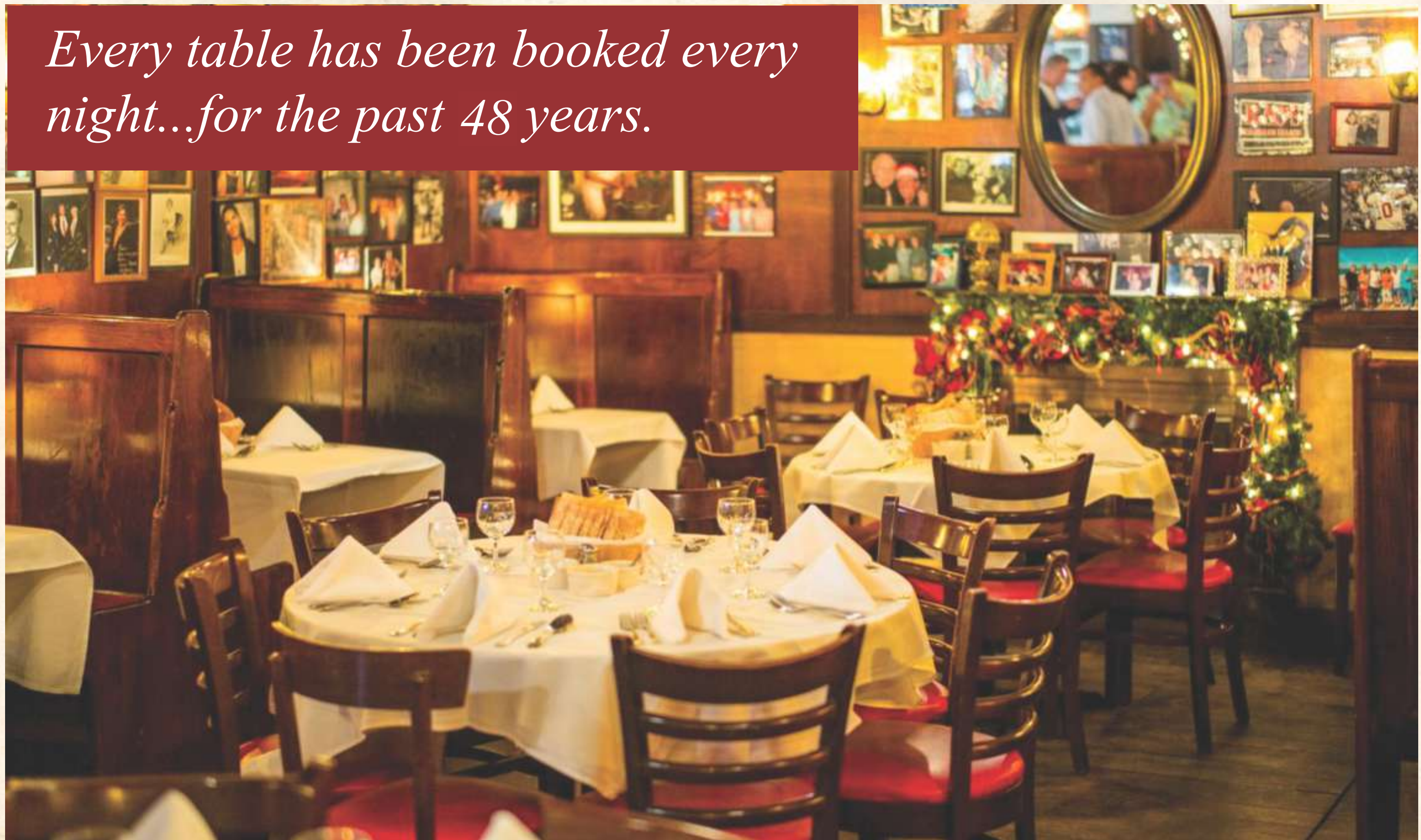
Main dining area

Every table has been booked every night...for the past 48 years.