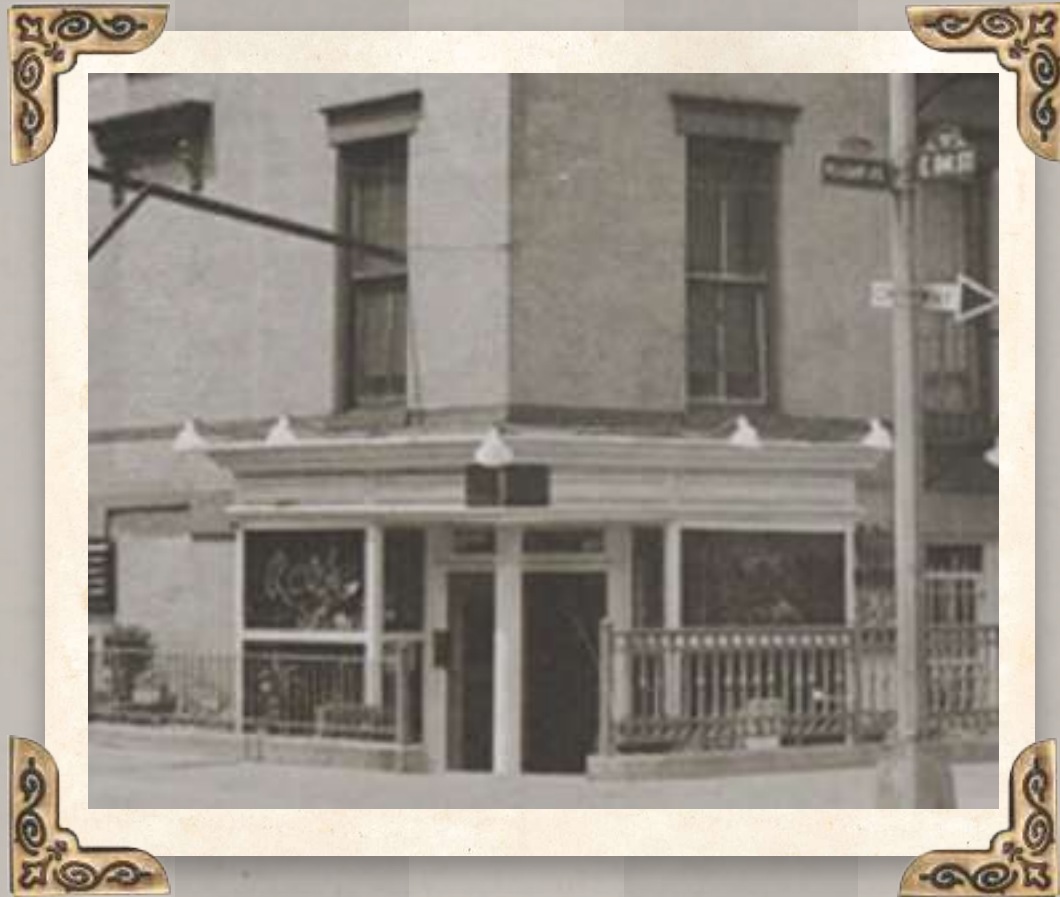
East Harlem 1896